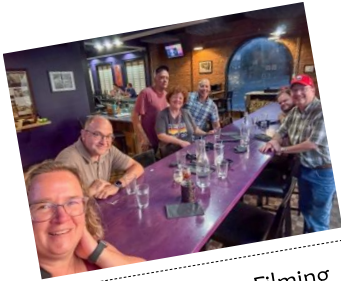
Dinner Out after Filming