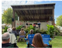
Paw Paw Community Worship